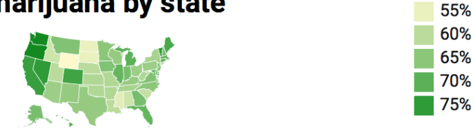
• • Embed • Created with Datawrapper